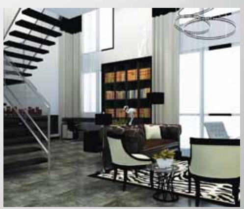
Loft (Condominium Unit), Bintulu Paragon