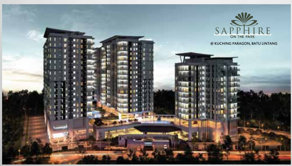
Sapphire On The Park, Kuching, Sarawak