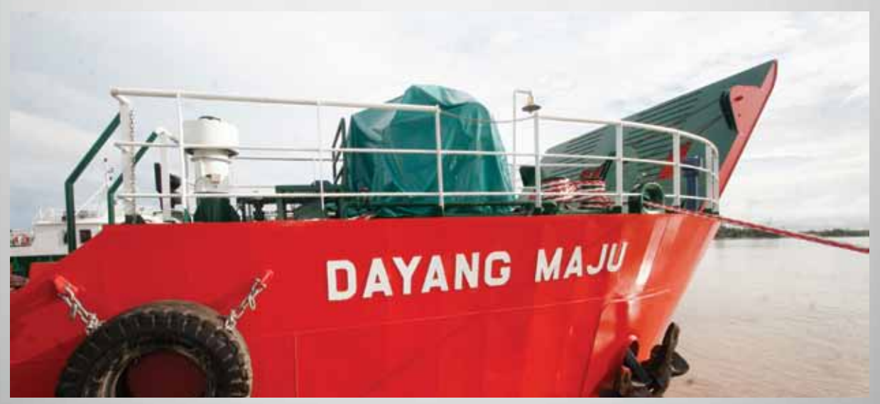
Dayang Enterprise Holdings Bhd

With the experience garnered from these ventures, Naim is looking forward to increase its involvement in relation to infrastructure works in this sector in time to come.