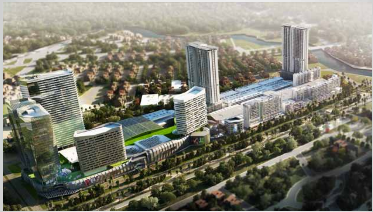
Aerial View, Bintulu Paragon

Covering an area of 36 acres, Bintulu Paragon is the largest integrated development to impact Bintulu. A new landmark and the largest hub which introduces multifaceted lifestyle experiences, Bintulu Paragon will change Bintulu's skyline with its modern condominium buildings, sleek office towers and other iconic buildings. For business or for pleasure, Bintulu Paragon is the prestigious address that sets a benchmark not only for Bintulu, but also for Sarawak.