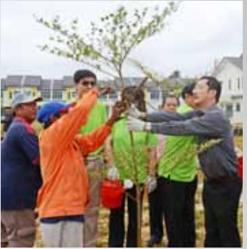
Naim together with the Council organised a joint tree planting event at the green lung of Riveria Phase 7