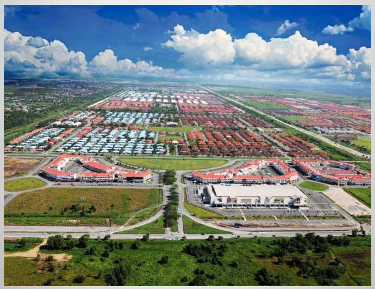
Aerial View, Bandar Baru Permyjaya, Miri, Sarawak