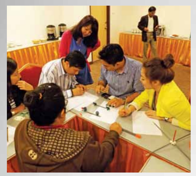
Naim Academy's 'Business Writing Skills' Workshop