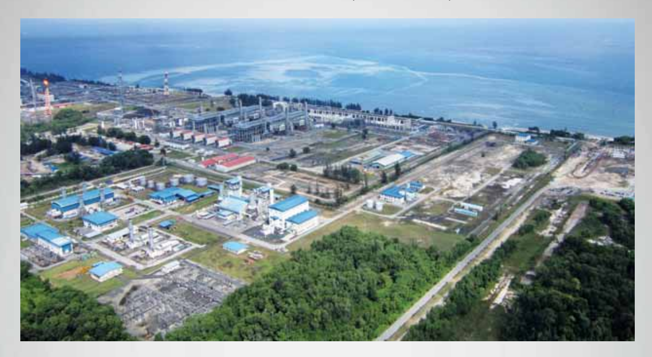
SABAH OIL & GAS TERMINAL (SOGT) PROJECT, SABAH

PETRONAS LNG TRAIN 9 PROJECT, BINTULU, SARAWAK