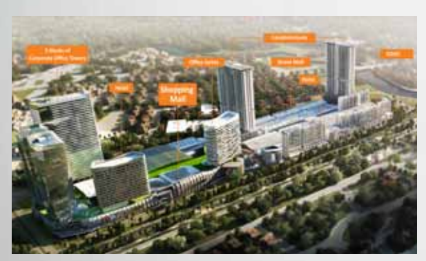
Bintulu Paragon Integrated Development, Bintulu, Sarawak