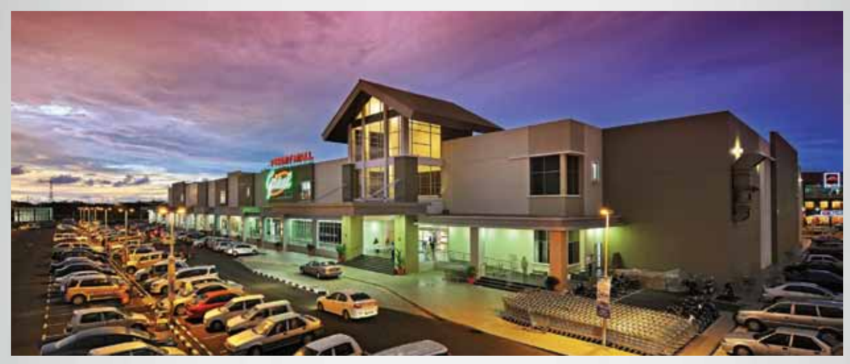
Permy Mall, Bandar Baru Permyjaya, Miri, Sarawak

Naim has planned for similar projects within the Kuching Paragon integrated development and Bintulu Paragon integrated development in Kuching and Bintulu respectively.