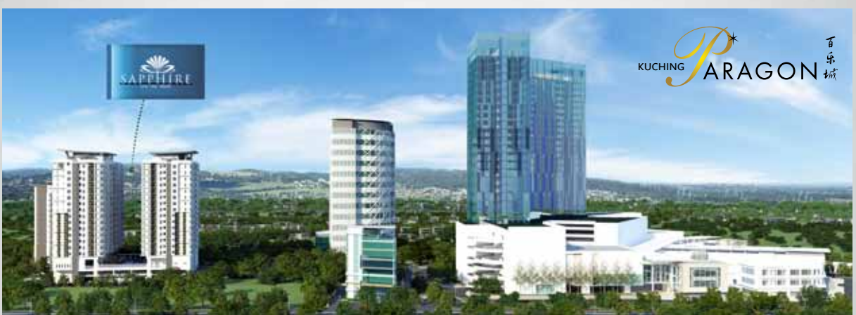
Aerial View, Kuching Paragon, Kuching, Sarawak

Within the iconic Kuching Paragon, 3 residential towers rise majestically as one of the most sought after high end condominium apartments in the region. With a total of 445 residential units and built with a contemporary tropical minimalist concept which epitomises resort and chic urban living, the SAPPHIRE ON THE PARK condominium development is in a class of own.