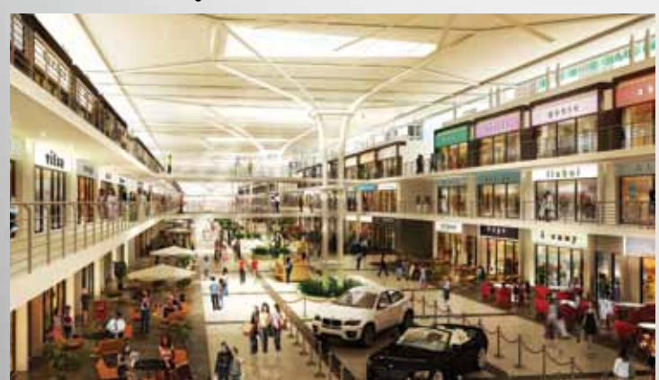
Street Mall, Bintulu Paragon